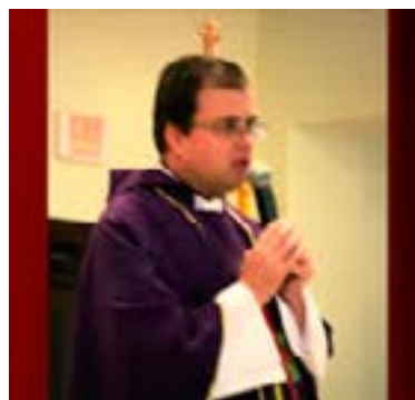
St. Rose of Lima Church

Para mayores informes llamar al: (619) 816-8361 strosegpodeoracion@yahoo.com