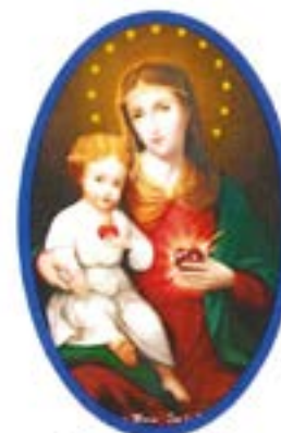
"A Jesus por Maria"